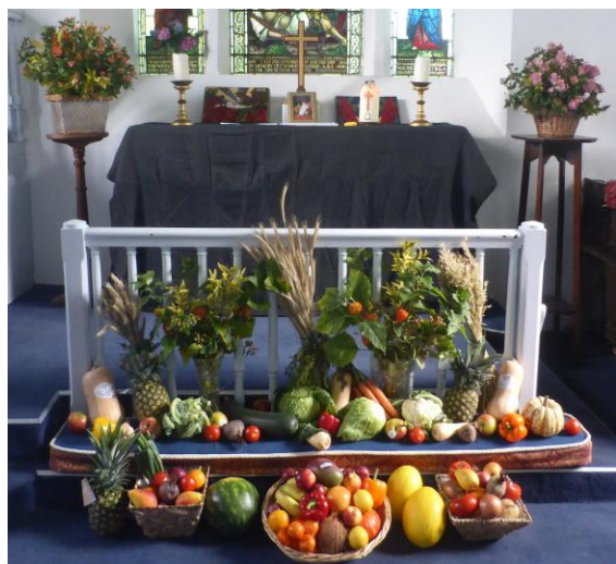
Photograph of Harvest Altar 2022

Please come along on the Saturday afternoon at 2pm and bring as much colourful fruit and veg as you are able, to add to the display in front of the altar. Gifts of home-made cakes and other produce are also very much welcomed.