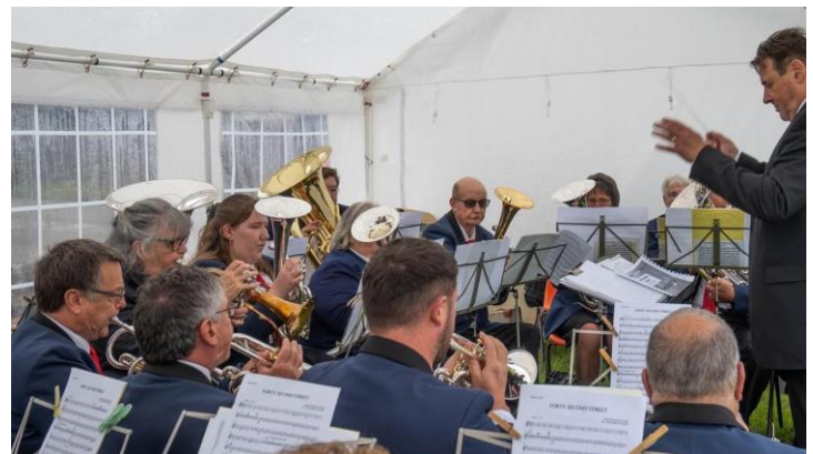
Warslow Silver Band