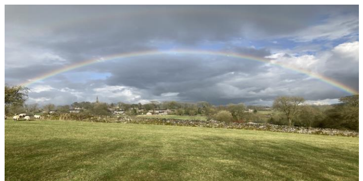
Butterton Calendar – Front Page Winner